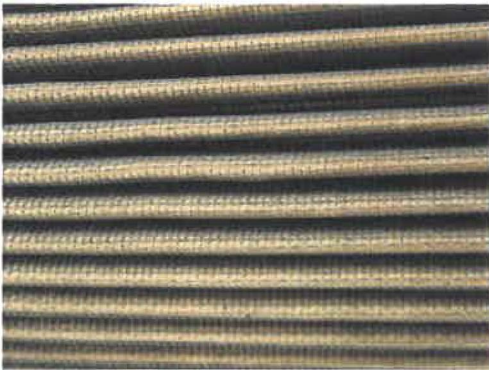
DAYTONA Air Filter that has been Cleaned and NOT oiled.