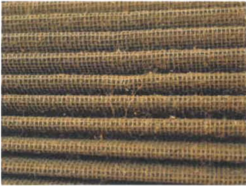
Dirty DAYTONA Air Filter that is NOT Ready to be cleaned.

Cleaning your DAYTONA AIR FILTER is not required if you can still see the wire screen on the entire air filter, regardless of how dirty it may appear. If you have not experienced a decrease in mileage or engine performance, chances are your DAYTONA AIR FILTER is fine and does not yet need to be cleaned. When the screen is no longer visible some place on the air filter, it is time to clean it. Check out these photos of dirty and clean air filters to help determine if your DAYTONA AIR FILTER needs cleaning.