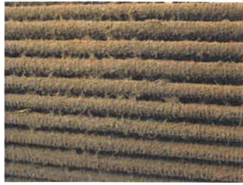
Dirty DAYTONA Air Filter that IS Ready to be cleaned.