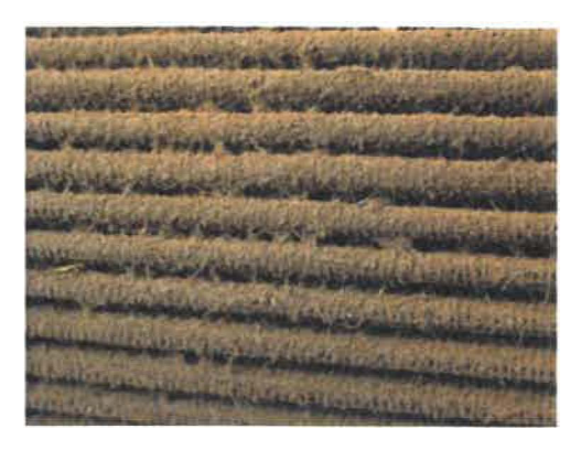
Dirty DAYTONA Air Filter that IS Ready to be cleaned.