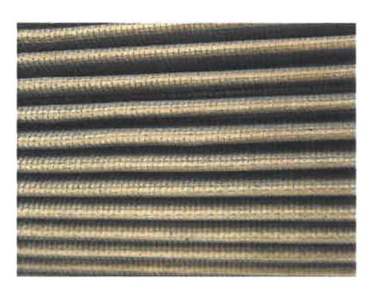
DAYTONA Air Filter that has been Cleaned and NOT oiled.