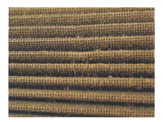
Dirty DAYTONA Air Filter that is NOT Ready to be cleaned.

Cleaning your DAYTONA AIR FILTER is not required if you can still see the wire screen on the entire air filter, regardless of how dirty it may appear. If you have not experienced a decrease in mileage or engine performance, chances are your DAYTONA AIR FILTER is fine and does not yet need to be cleaned. When the screen is no longer visible some place on the air filter, it is time to clean it. Check out these photos of dirty and clean air filters to help determine if your DAYTONA AIR FILTER needs cleaning.